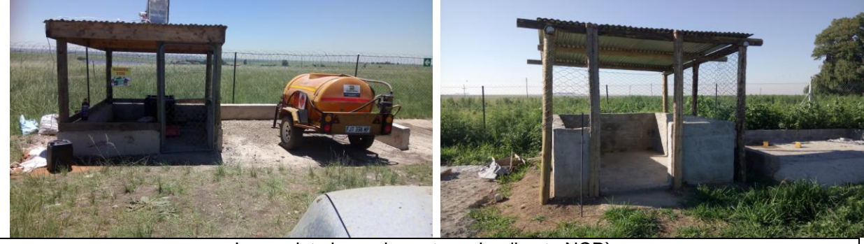
Incomplete hazardous stores leading to NCR's

The following table presents examples of some of the site activities and observations